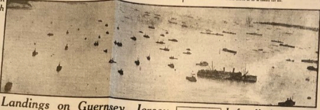
Landings on Guernsey, Jersey

*Obstacles which the Germans had constructed in the sea have not proved to be as formidable as they were expected to be.