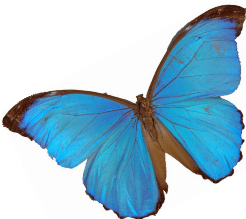
Papilio menelaus from the Linnean collection